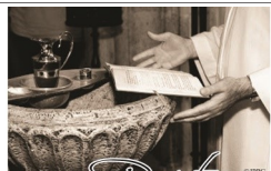
The Sacrament of Baptism

THE NEXT BAPTISMAL WORKSHOP 7PM in the Religious Ed. Bldg. Wednesday, December 11, 2019