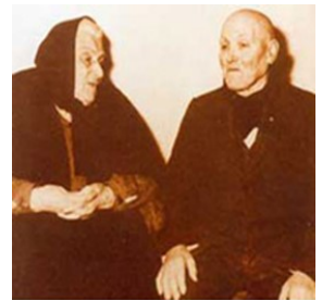
Saint Maria's mother speaks to her daughter's murderer at the canonization.