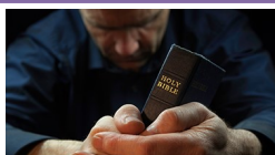
MEN'S WEEKEND RETREAT

Next meeting March 25, 6:30pm Mass in the church , followed by meeting in the parish hall. Further info: Call the parish office: 732-270-3980