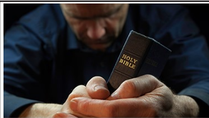
MEN'S WEEKEND RETREAT

And for our President and elected leaders of our Country.